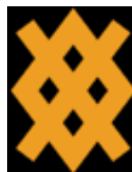
8. AFC Wimbledon