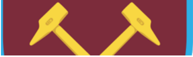
1. West Ham

Here is a snipping of the badges of nine current English league clubs – with a common theme linking them. They get more difficult as they go on.